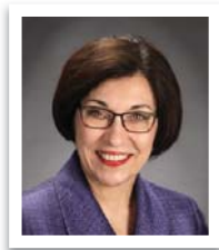
Hon. Judith K. Fitzgerald (Ret.)

U.S. BANKRUPTCY COURT FOR THE WESTERN DISTRICT OF PA, PITTSBURGH