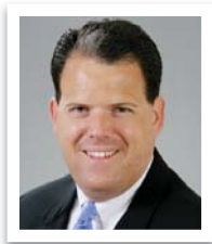
Hon. Gregory L. Taddonio

U.S. BANKRUPTCY COURT FOR THE WESTERN DISTRICT OF PA, PITTSBURGH