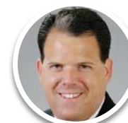
Hon. Gregory L. Taddonio U.S. BANKRUPTCY COURT FOR THE WESTERN DISTRICT OF PA PITTSBURGH